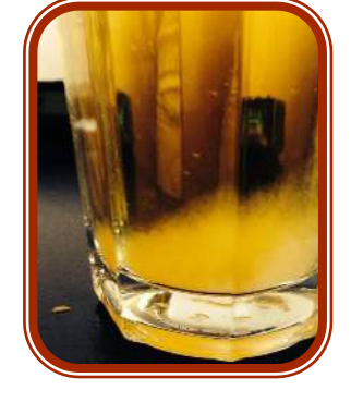
It doesn't matter if the sediment looks like snowflakes, strings, or a general cloudiness.

The more sediment, the more lymphatic waste your body is filtering out!